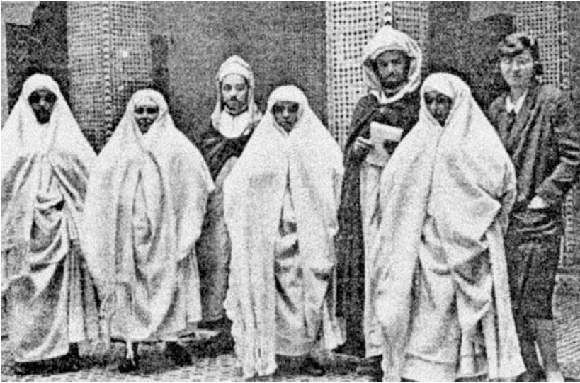
Image 1 – The whole team of “Majzen Health Care”, with two clears from the “Bacha”. Source: Estampa , n. 210, pp. 3-5. 1932.